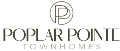
EXHIBIT "B" - Buyer Acknowledgement

Buyer has been to www.PoplarPointeOffer.com and acknowledges receipt of and approval of the following documents: